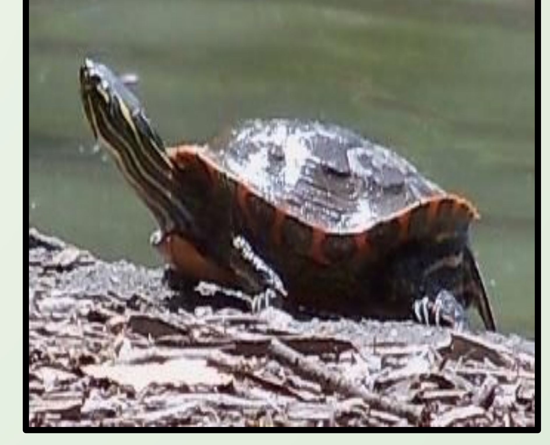
Common Name: Pond Slider Scientific name: Trachemys Scripta

Description: This plant can grow up to three feet tall. It is toxic to humans if eaten, but is a very popular plant to grow. The Egg leaf Spurge has roots and seeds that can be viable for 5 to 8 years.