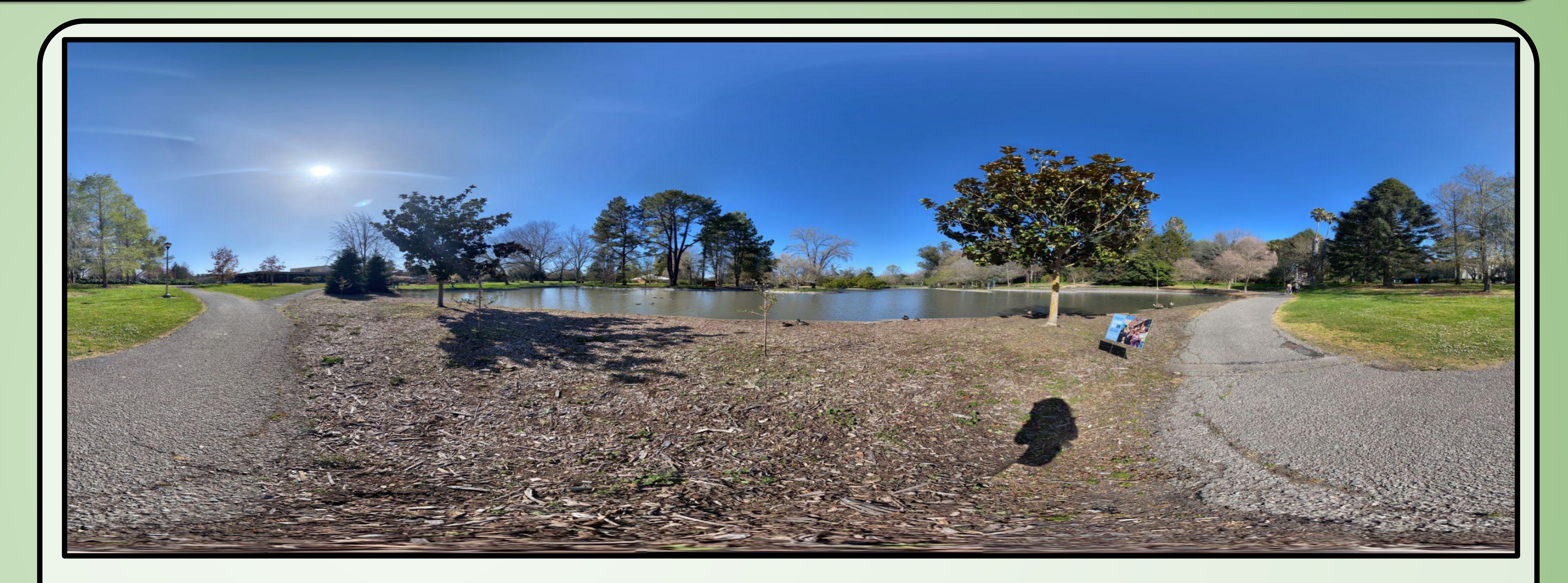
Figure 1: Commencement Lake, Sonoma State University

We filmed our photosphere behind the Commencement Lake, near Copeland Creek. Here we observed wildlife and photographed them in the natural environment. We then used these photos to annotate our photospheres with species profiles.