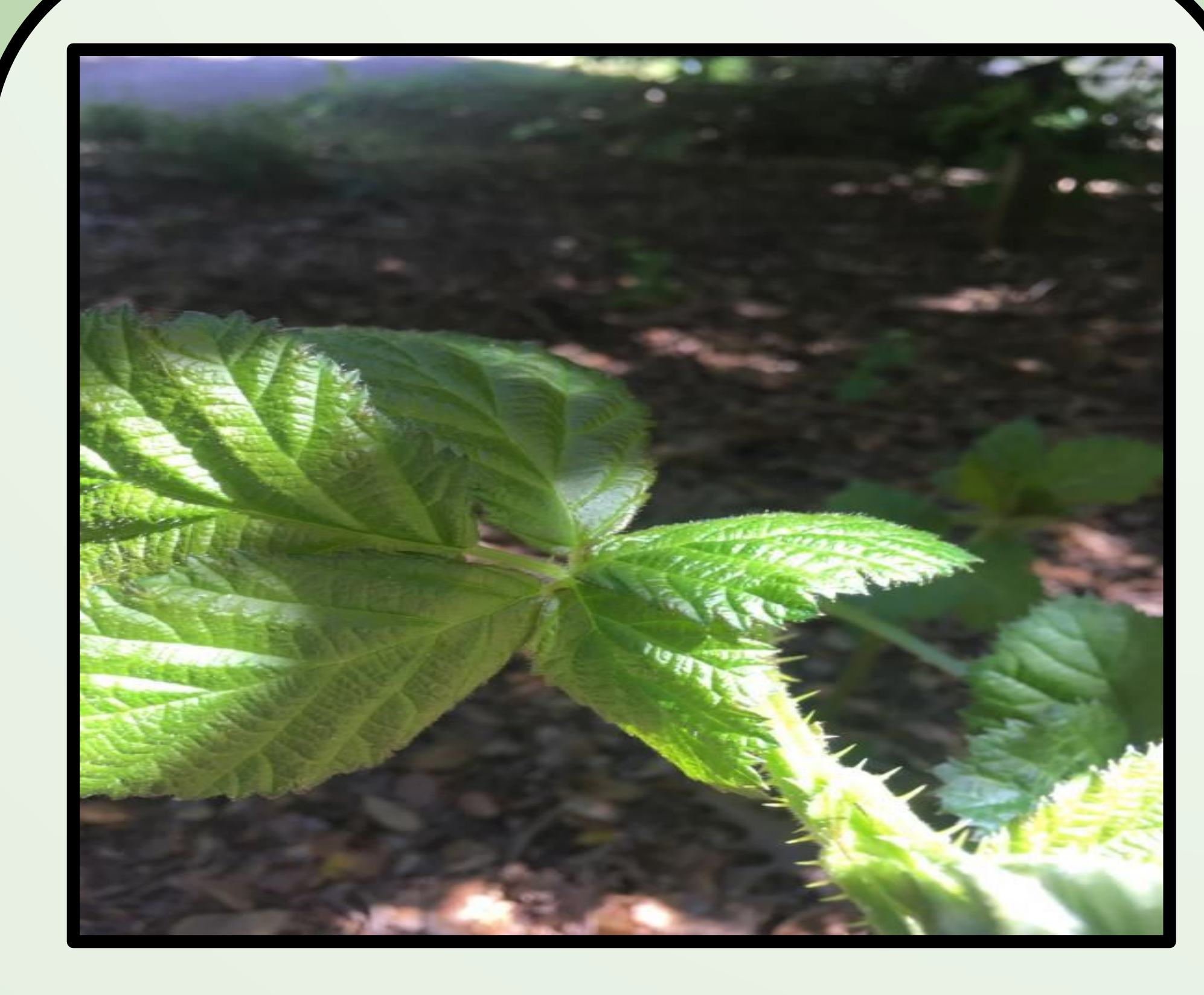
Common Name: Himalayan Blackberry Scientific Name: Rubus armeniacus

Description: Wild Radishes are usually harvested before they become a flower. They are usually eaten as a crunchy pungent vegetable in salads. They are not native to the area and are considered an invasive species.