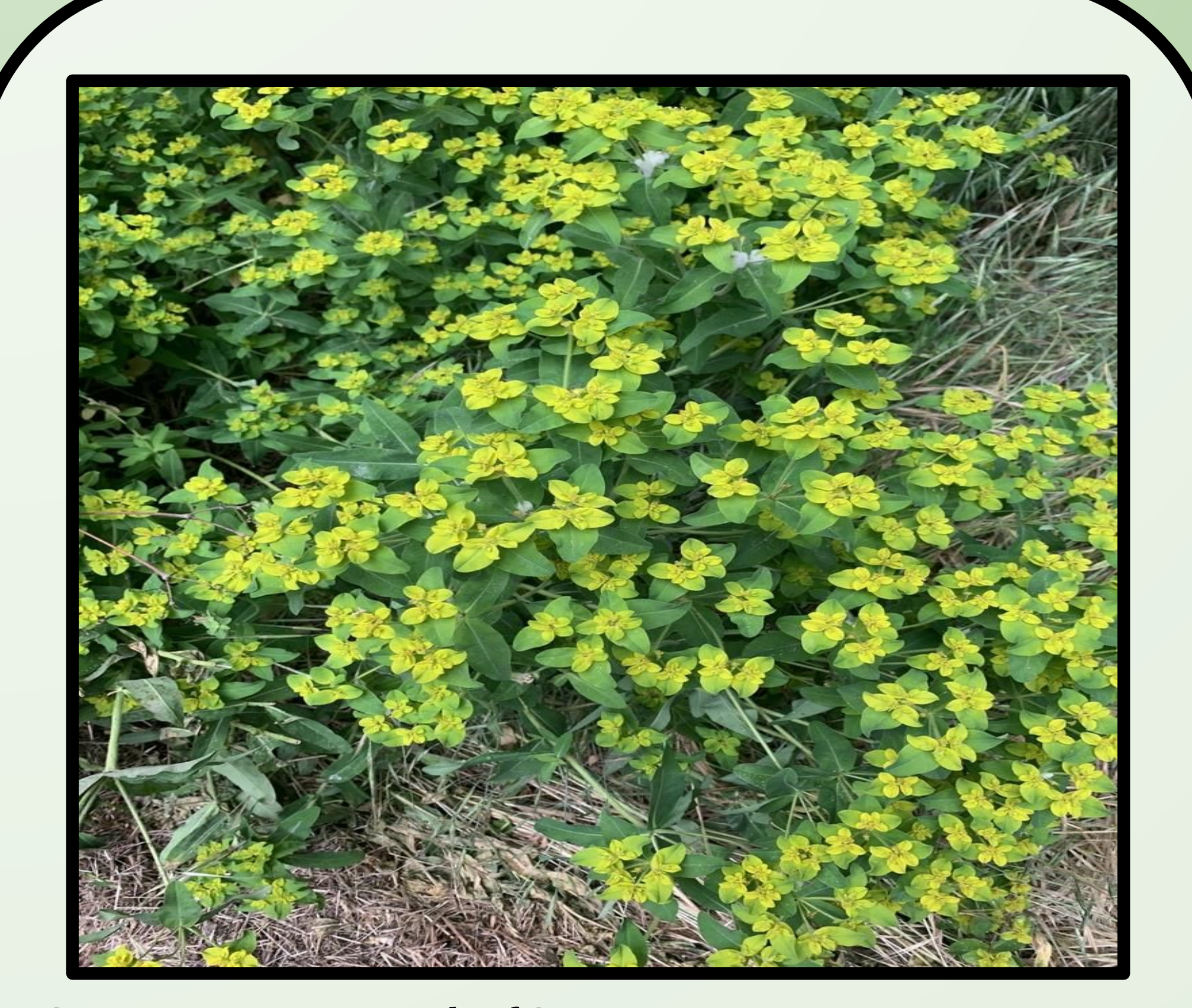
Common Name: Egg leaf Spurge Scientific Name: Euphorbia Oblongata Description: This plant can grow up to three fe toxic to humans if eaten, but is a very popular plant.

Description: The Himalayan Blackberry, Rubus armeniacus , Is a species of blackberry that is known in the agricultural world as a noxious weed due to its ability to grow a thick underbrush that overtakes other plants.