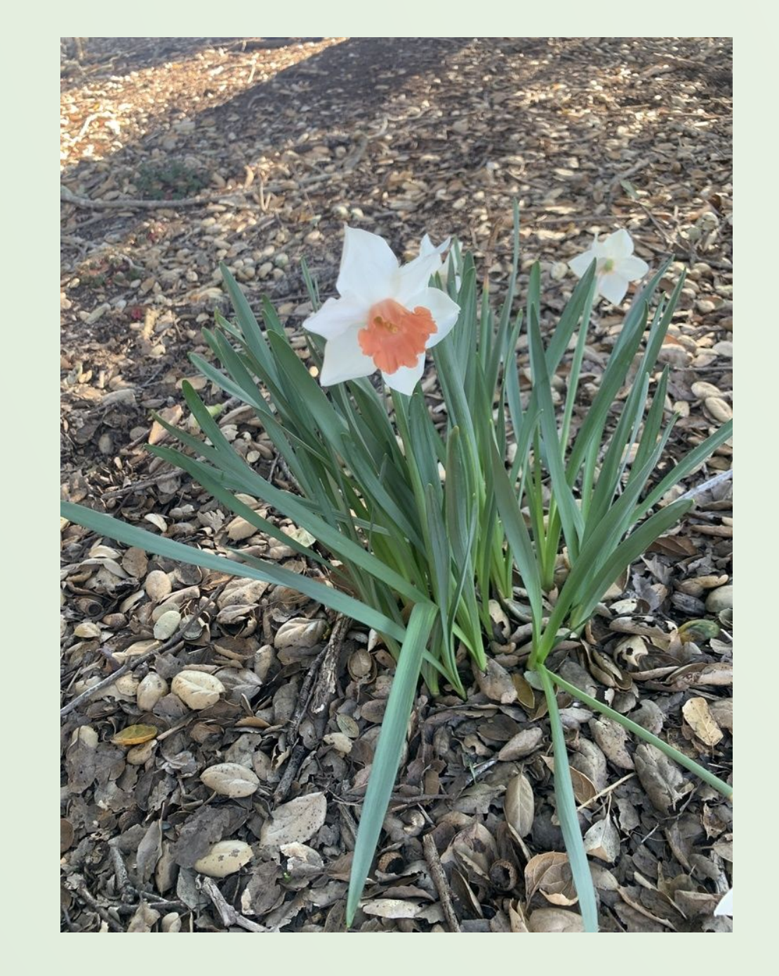
Figure 2: Daffodils

Daffodils (Genus Narcissus ) are native to Europe. They are as described as having a high stem and bear one large blossom that is cleft into six lobes with a central bell-shaped crown.