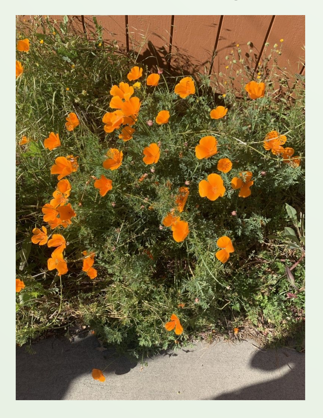
Figure 3: California Poppy

The California Poppy ( Eschscholzia californica) is native to North America. They are described as having four petalled flowers, usually yellow, orange, or cream with feathery gray-green foliage.