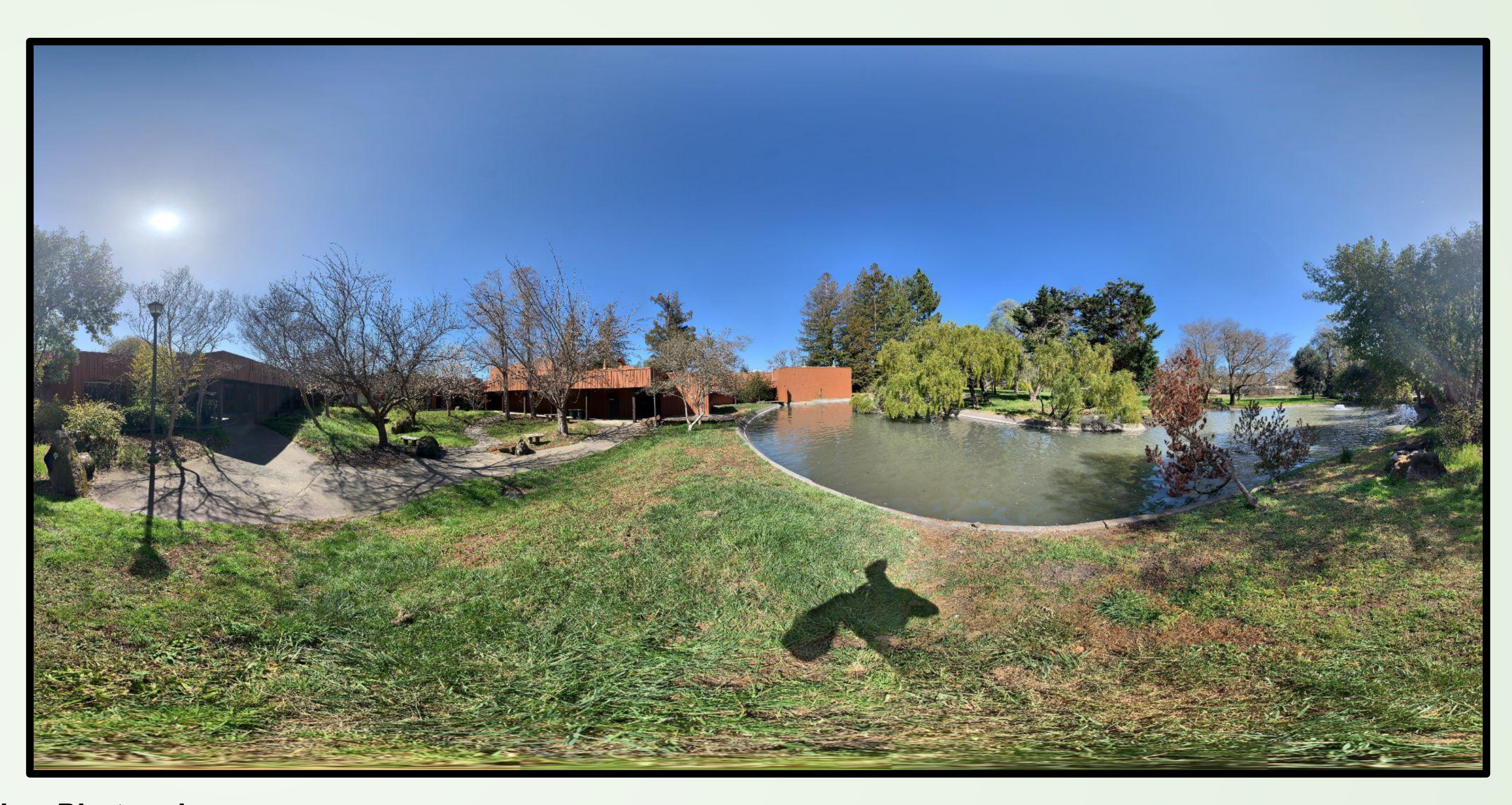
Figure 1: The Arbor Photosphere

An unannotated version of the photosphere is available online for anyone to view. The annotated version of the photosphere will be available to view through a website.