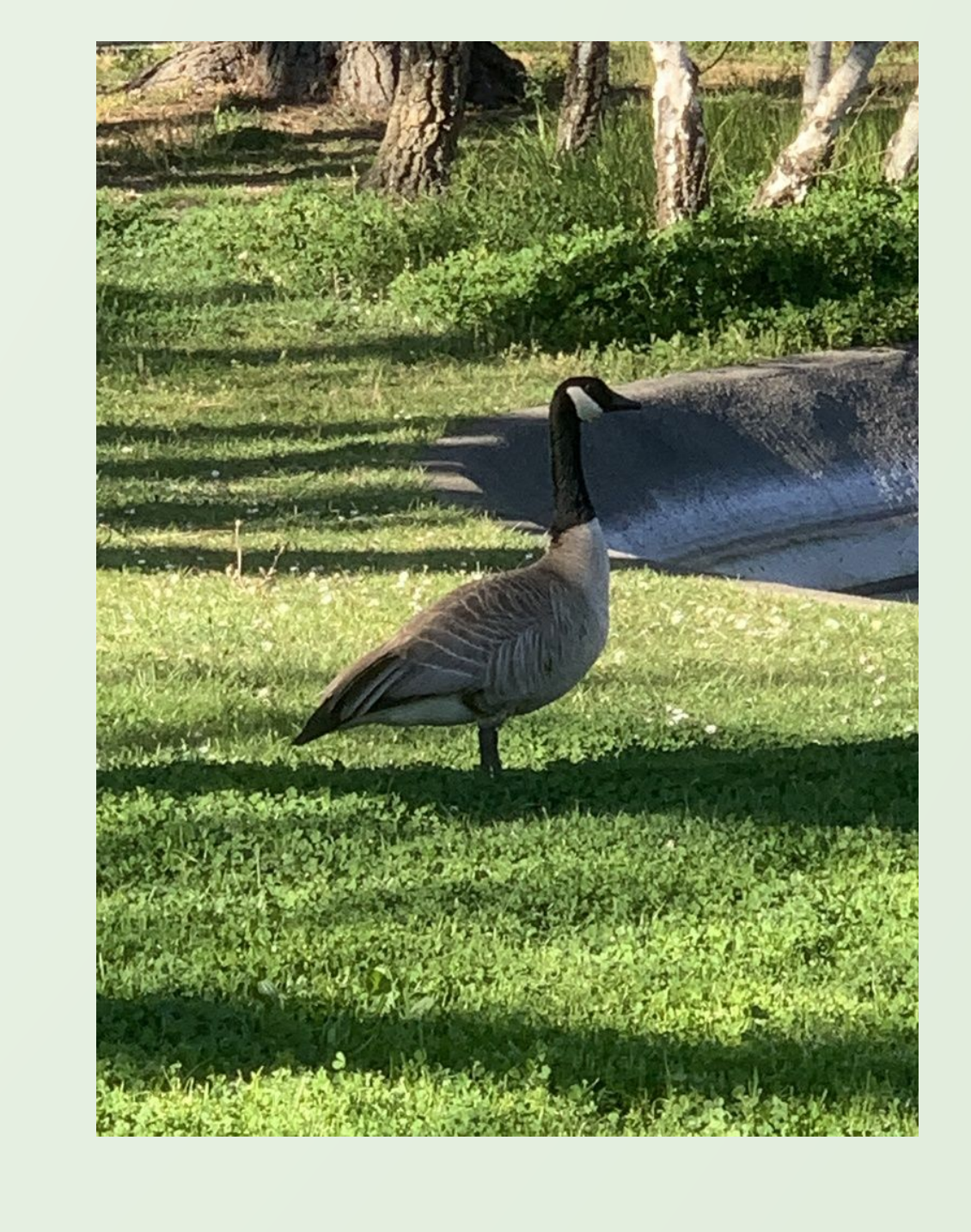
Figure 5: Canada Goose

Canada Goose (Branta canadensis) is native to North American. This is a large wild goose with a black head and neck, white cheeks and underside of chin, and a brown body.